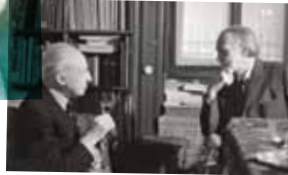
Zoltán Kodály with famed conductor Leopold Stokowski in 1967